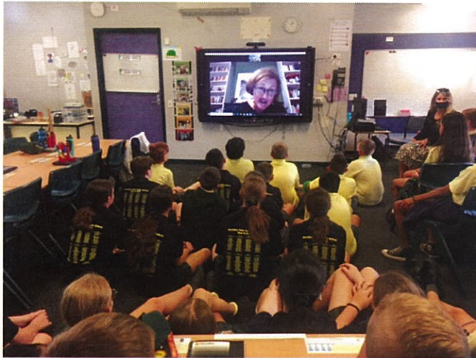
Me with the students of Class 5/6P, Narellan Vale Public School via Zoom

Tags: How to Become a Great Writer , Narellan Vale Public School , Virtual author visits