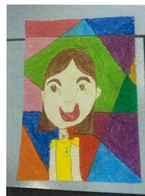
By Emelia P